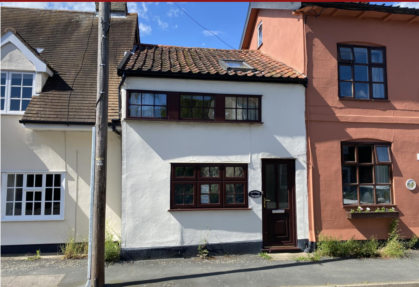
Weavers Cottage 22a Front Street Mendlesham Suffolk IP14 5RY