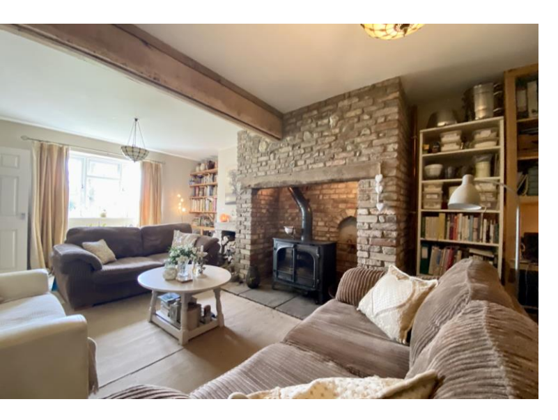
Guide Price £325,000

Sakura Plains 4 Owls Green Dennington IP13 8BY