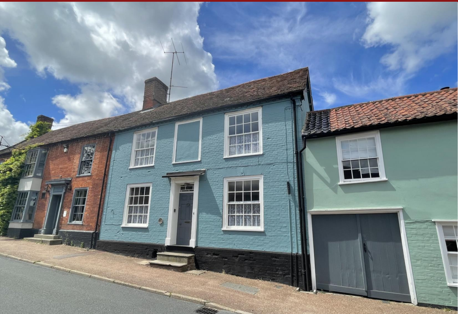
Astley House The Street Rickingham IP22 1BN