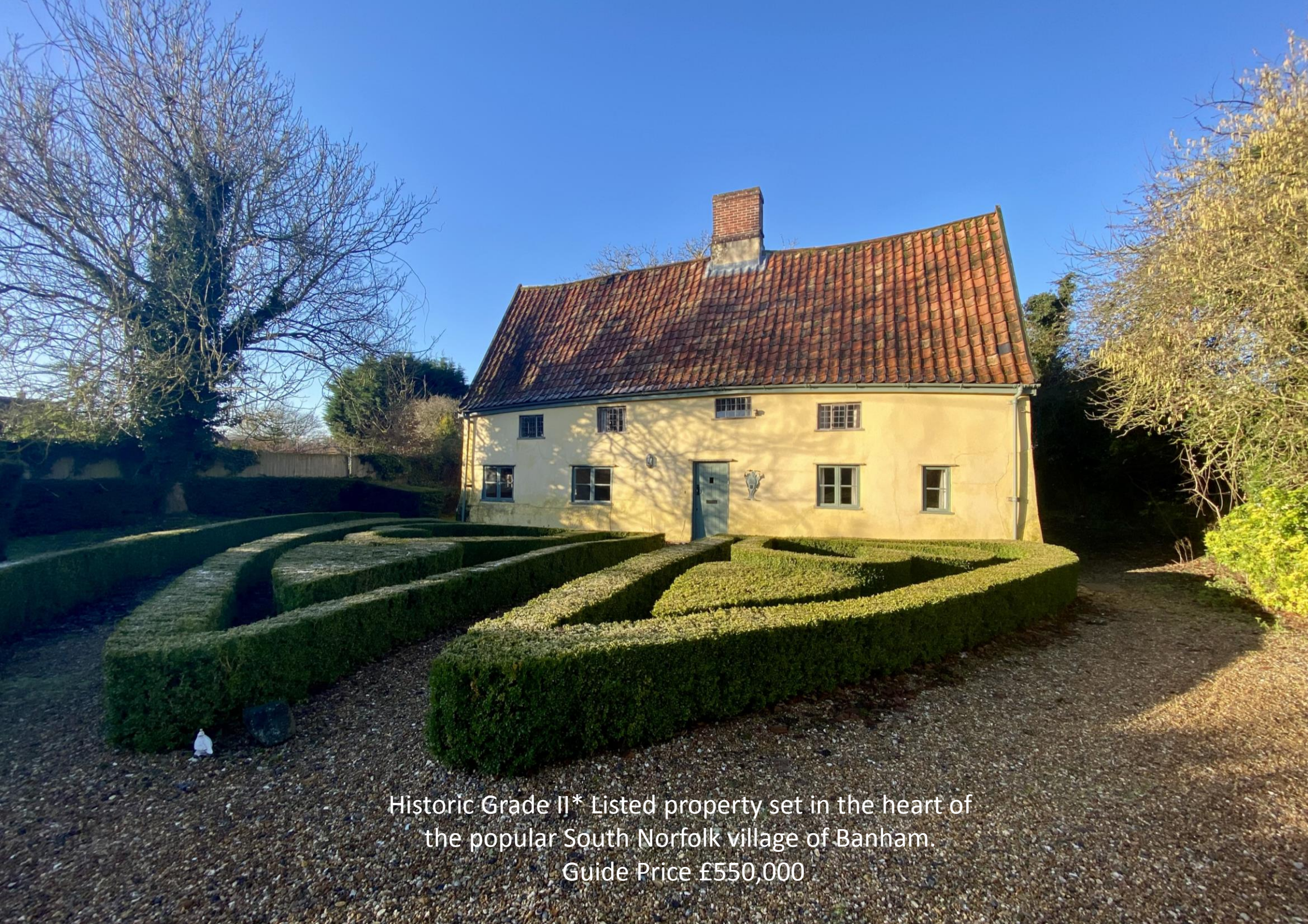
Historic Grade II* Listed property set in the heart of the popular South Norfolk village of Banham. Guide Price £550,000