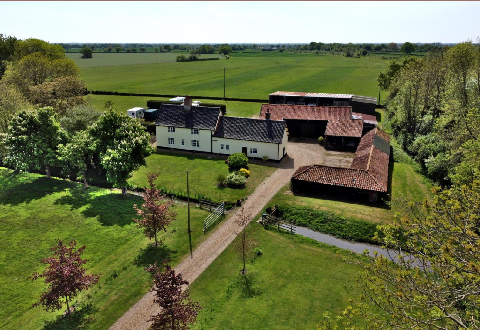
Furze Farm Short Green Winfarthing Diss, Norfolk IP22 2EE