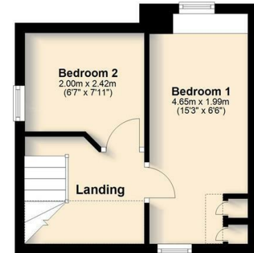
First Floor Approx. 20.0 sq. metres (215.0 sq. feet)

Total area: approx. 54.4 sq. metres (585.5 sq. feet)