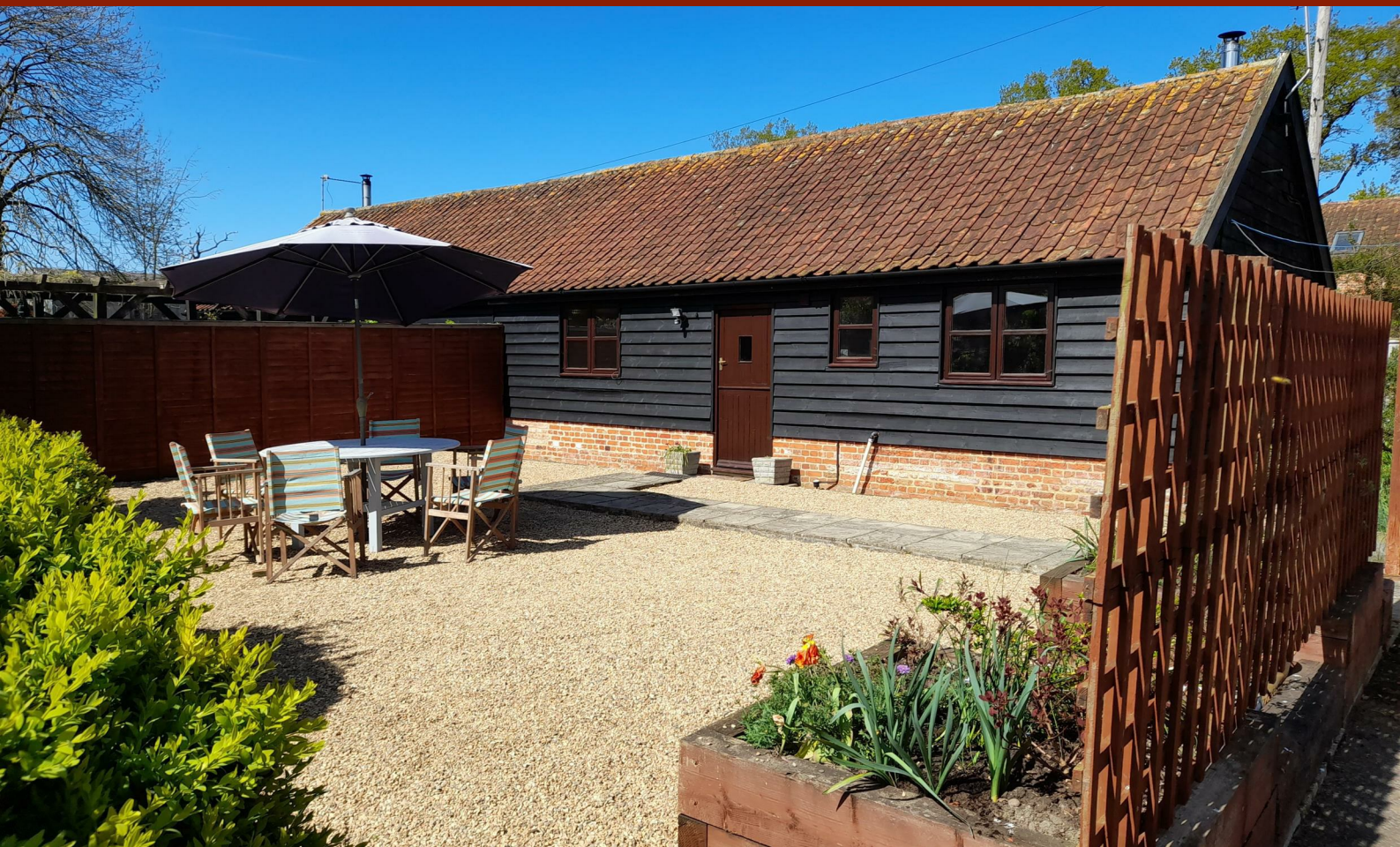
Red Farm Barn | Diss | IP21 4HW £825 PCM