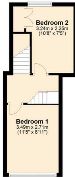
First Floor Approx. 23.4 sq. metres (251.5 sq. feet)