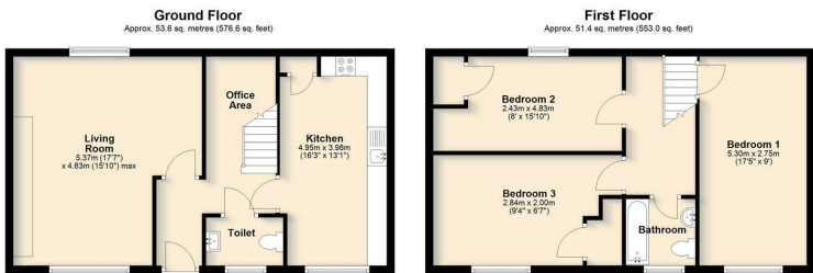
Total area: approx. 104.9 sq. metres (1129.6 sq. feet)

Once you apply for a tenancy and pay a Holding Deposit you will be referenced. This process will include (but not be limited to) a check on your credit history, employment/income sources and current landlord. You will be sent a link by a reference provider. Please follow the link and provide the requested information. Once the reference report is complete this will be provided to the Landlord, and when we have their approval we will contact you to confirm a start date.