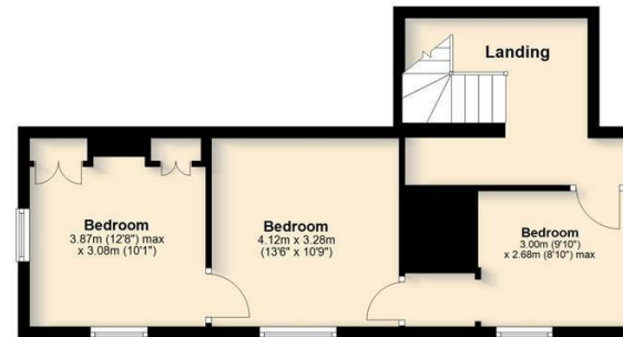
First Floor Approx. 41.1 sq. metres (442.3 sq. feet)

Total area: approx. 127.5 sq. metres (1372.4 sq. feet)