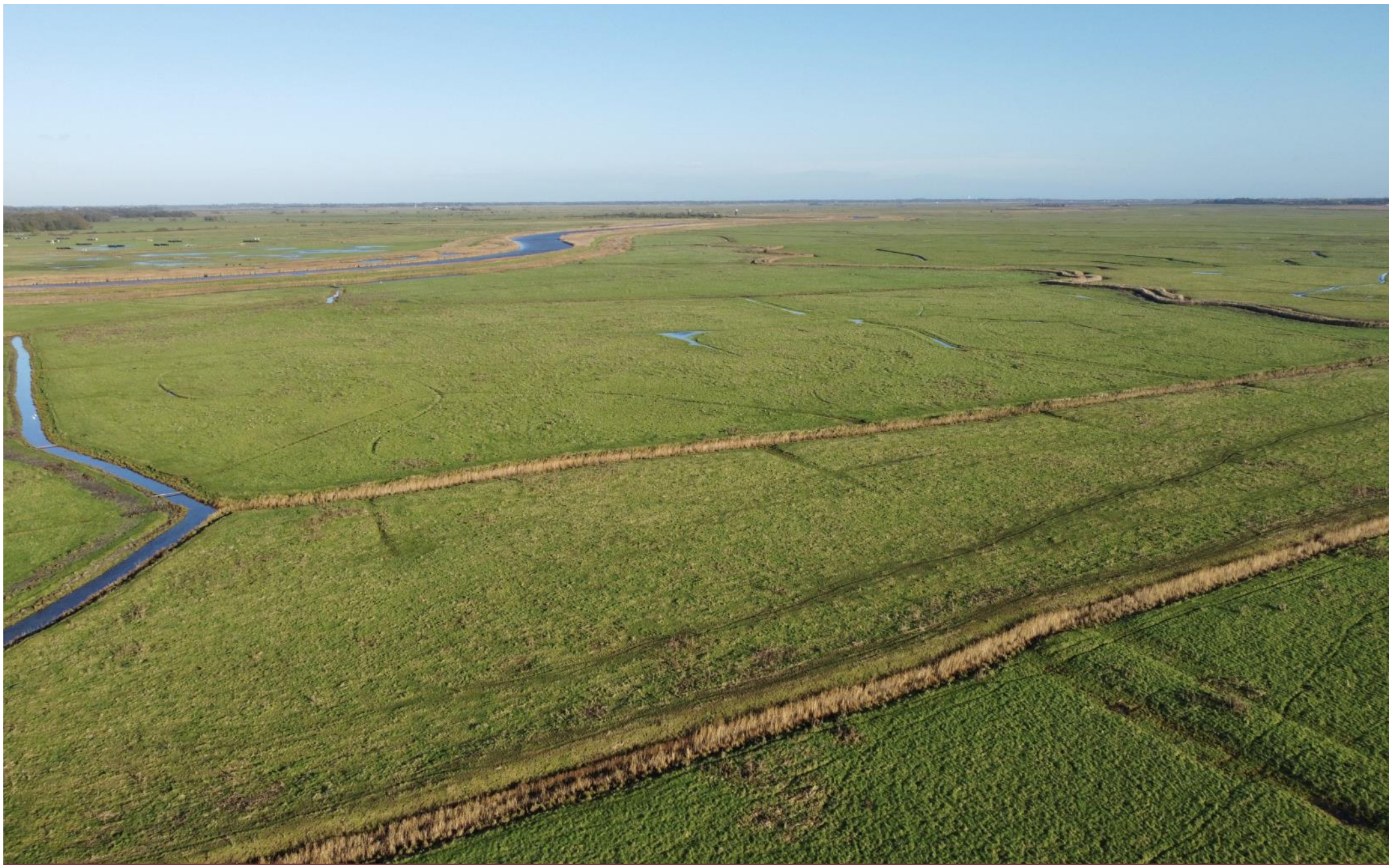
Grazing Marshes at Haddiscoe Island, Norfolk