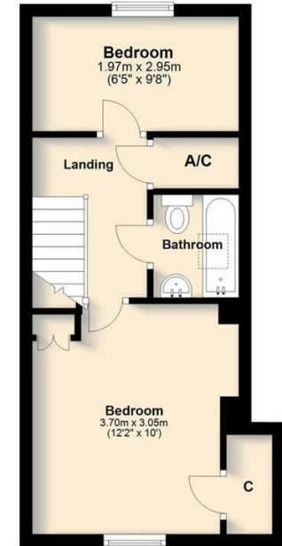
First Floor Approx. 28.4 sq. metres (306.1 sq. feet)

Total area: approx. 64.0 sq. metres (689.3 sq. feet)