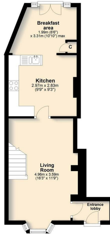
Ground Floor Approx. 35.6 sq. metres (383.2 sq. feet)