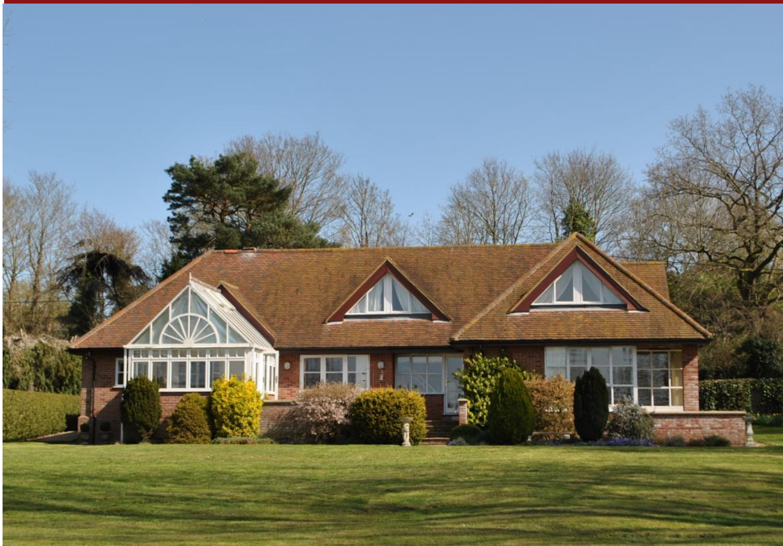
Wold House Castle Lane, Bungay Norfolk, NR35 1DE