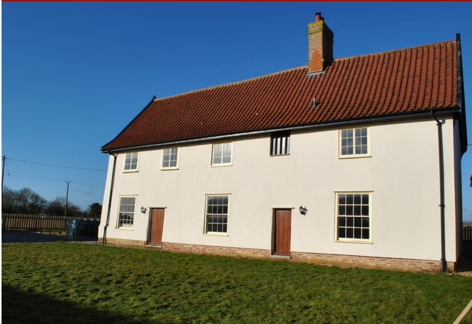
Long Row Farmhouse Tibenham Diss, Norfolk NR16 1PF