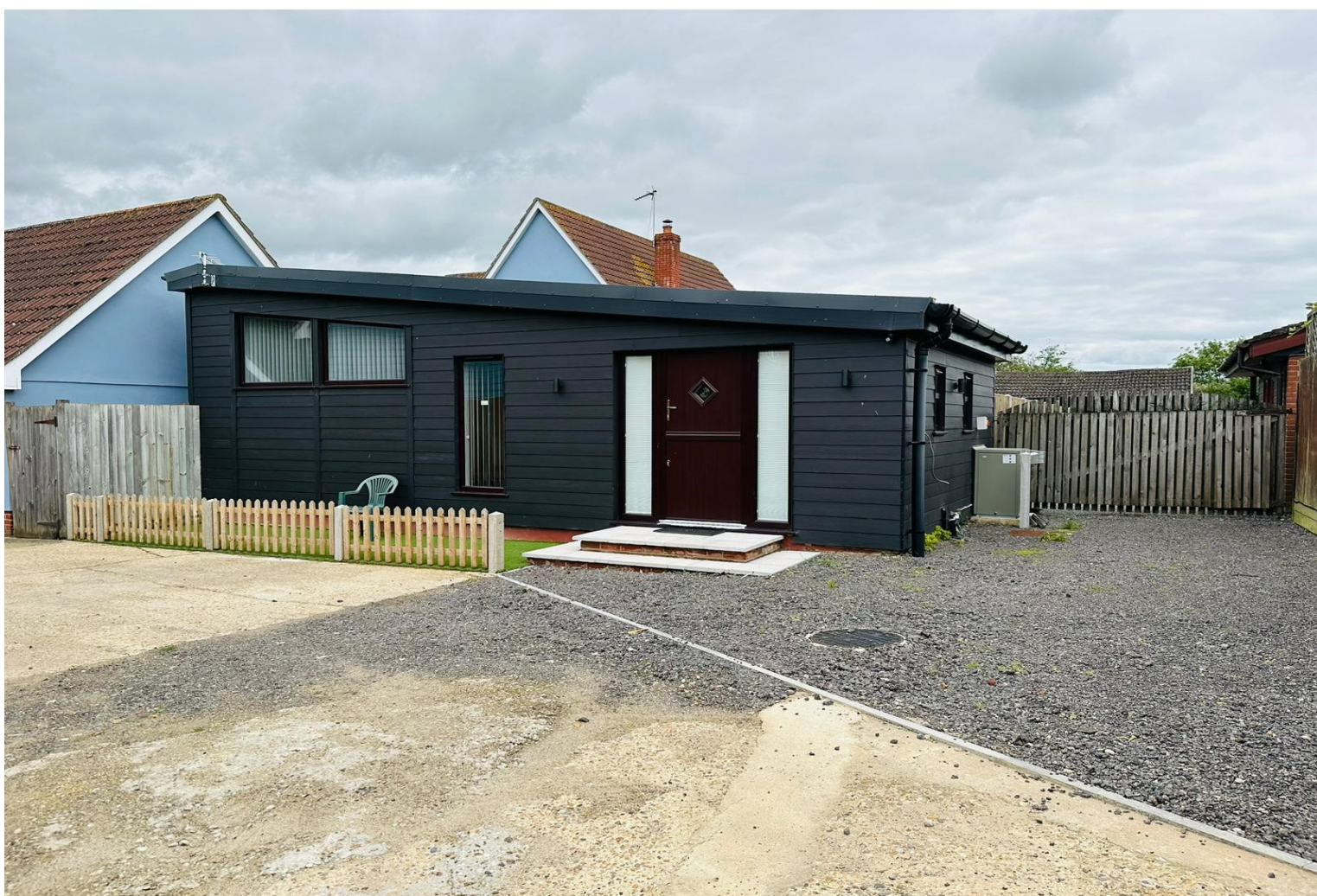
Horseshoe Barn Russet Close Finningham IP14 4TU