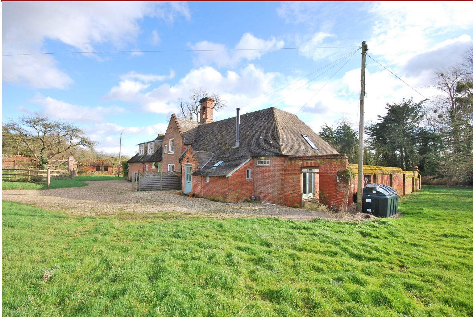
The Old Stables Tacolneston Hall Tacolneston NR16 1DW