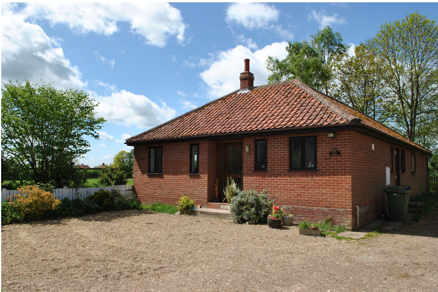
Church Farm Bungalow Church Road, Shelfanger Norfolk, IP22 2DG