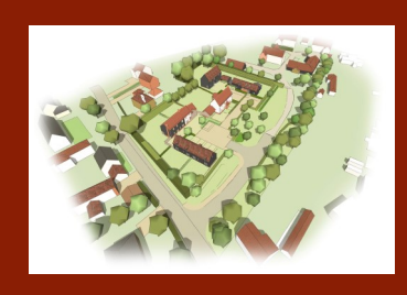
The Complete Service... for Landowners and Developers