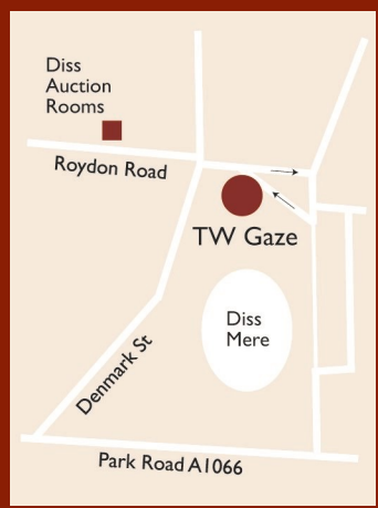
Diss 10 Market Hill Diss Norfolk IP22 4WJ