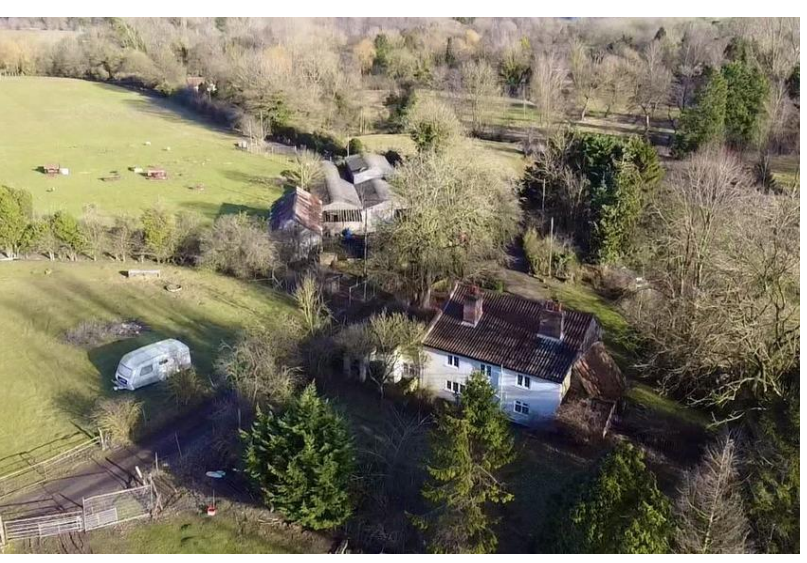
Offers Over £1m

Mill Farm Flordon Norwich Norfolk NR15 ILX