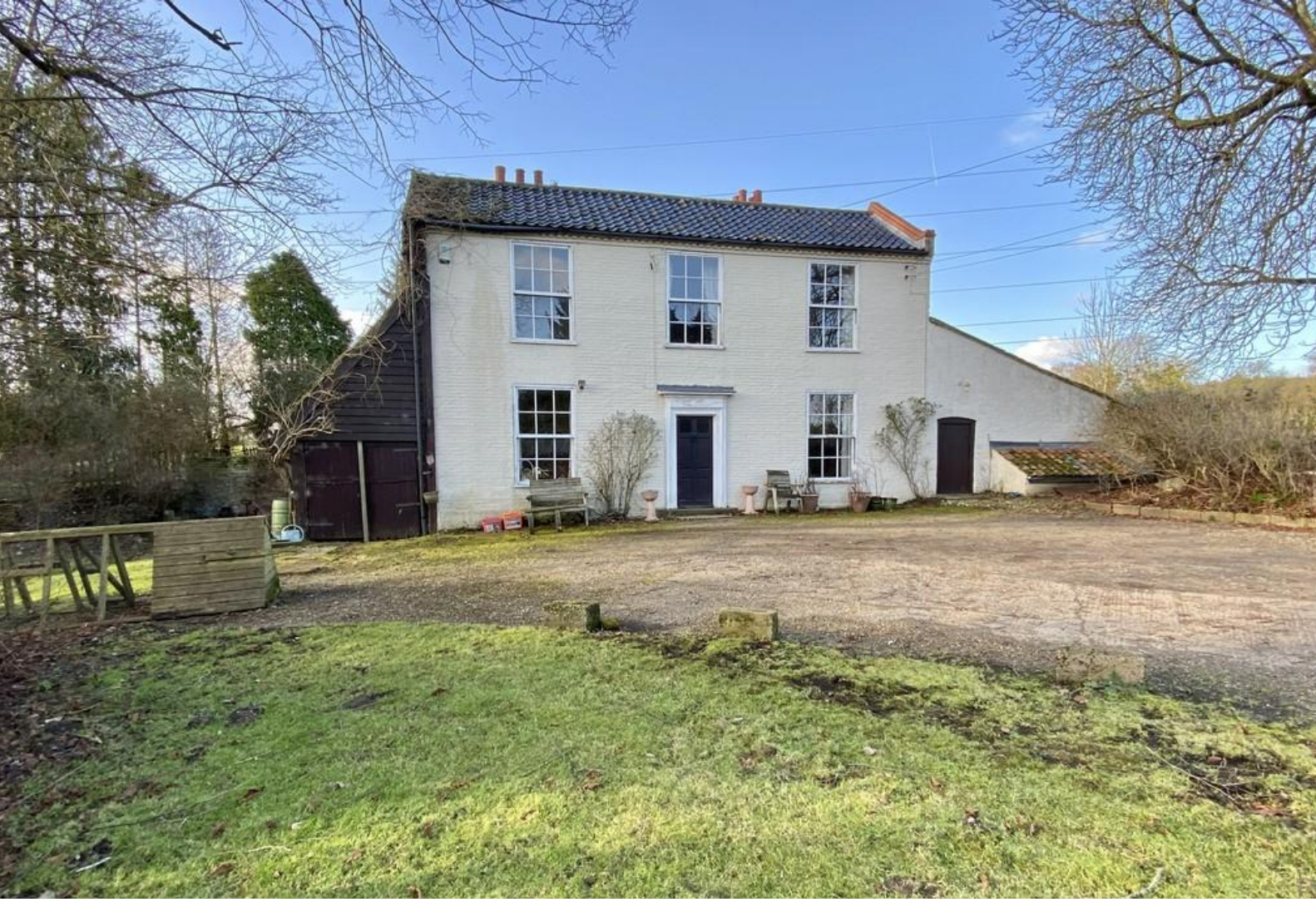
Set in 31ac of grassland with attractive views. Period house for updating together with a range of farm buildings.